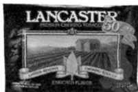
Lancaster 12 Pks