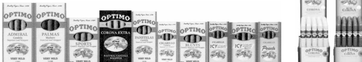
Admiral Candela/Natural Wrapper 50 Cigars Palmas Maduro Wrapper 50 Cigars Sports Candela/Natural Wrapper 50 Cigars Coronas Candela 50 Cigars Panetelas Candela/Natural Wrapper 50 Cigars Cigarillo Candela 100 Cigars Blunts 50 Cigars Cigarillo Icy Mint 100 Cigars Blunts Peach 50 Cigars Cigarillo Honey 100 Cigars Coronas Natural Wrapper Per Display Rum Coronas Natural Wrapper Per Display