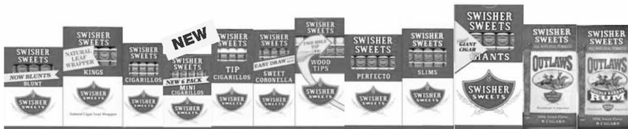
Blunt 50 Cigars King 50 Cigars Cigarillos 100 Cigars Mini Cigarillos 120 Cigars Tip Cigarillos 100 Cigars Coronella 100 Cigars Wood Tips 50 Cigars Perfecto 50 Cigars Slims 50 Cigars Giants 50 Cigars Outlaws\ 48 Cigars Outlaws Rum 48 Cigars