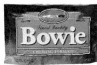
Bowie 12 Pks