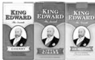
King Edward Cherry Per Ctn King Edward Ice Per Ctn King Edward Menthol Per Ctn