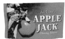
Apple Jack 12 Pks