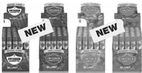
Original Per Ctn Grape Per Ctn Peach Per Ctn Strawberry Per Ctn