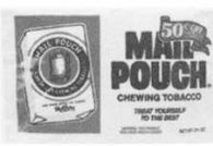
Mail Pouch 12 Pks