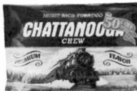
Chattanooga Chew 12 Pks