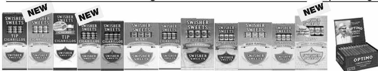
Grape Tip Cigarillos 100 Cigars Peach Tip Cigarillos 100 Cigars Cherry Tip Cigarillos 100 Cigars Cinnamon Cigarillos 100 Cigars Chocolate Cigarillos 100 Cigars Strawberry Blunts 50 Cigars Strawberry Cigarillos 100 Cigars Tequila Perfecto 50 Cigars Tequila Cigarillos 100 Cigars Peach Blunts 50 Cigars Peach Cigarillos 100 Cigars Honey Kings 50 Cigars Coronas Extra 60 Cigars