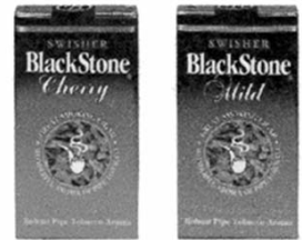
Blackstone Cherry Per Ctn Blackstone Mild Vanilla Per Ctn