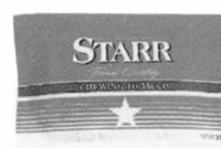
Starr 12 Pks