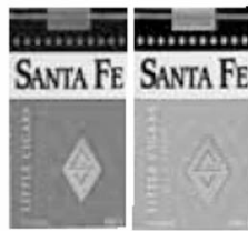
Santa Fe Regular Ctn Santa Fe Menthol Ctn