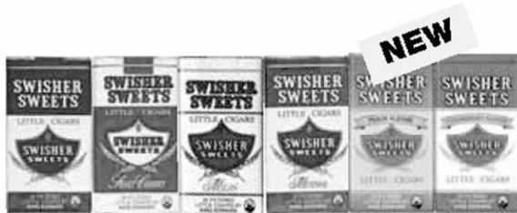
Regular Per Ctn Cherry Per Ctn Milds Per Ctn Menthol Per Ctn Peach Per Ctn Strawberry Per Ctn